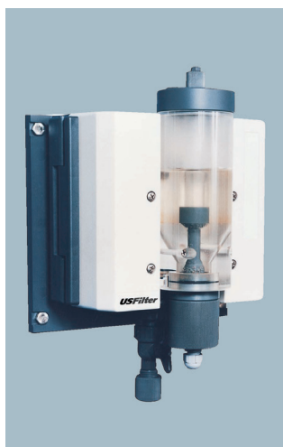
Bare-Electrode Measuring Cell

If fluoride is the only parameter to be measured, then a simple, flowthrough probe assembly can be provided. This consists of a Y-type flow-thru probe holder and a sample valve. Note that temperature measurement and output is not available with this configuration.