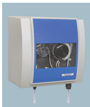
Micro/2000® Residual Analyzer

Deox/2000® Dechlorination Analyzer: A precise instrument for accurately measuring both SO 2 and total chlorine residuals in wastewater effluent. See WT.050.515.000.UA.PS.