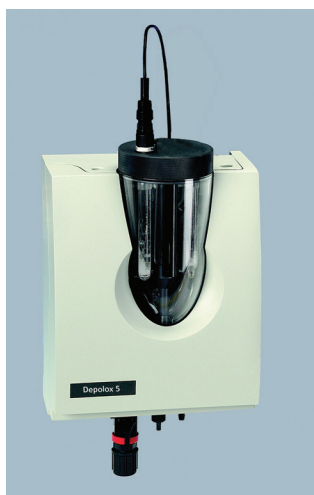
Depolox® 5 cell