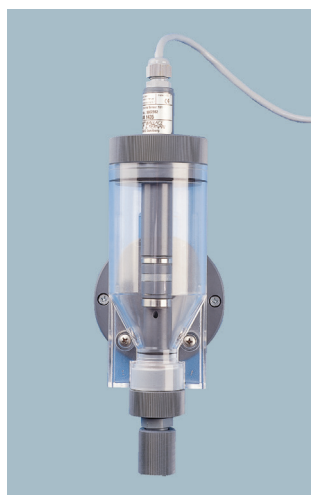
Membrane Type Measuring Cell