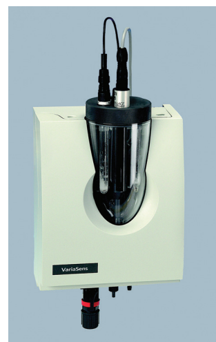
VariaSens™ Flow Cell