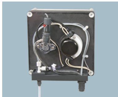
Sample Flow System